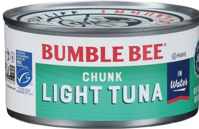
Bumble Bee Chunk Light Tuna 10/$10 00